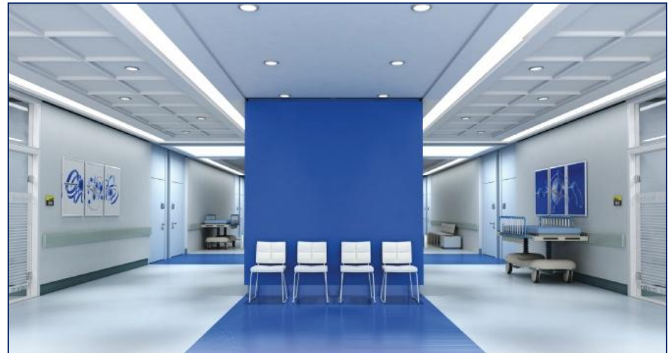
Hospitals and Doctors' Surgeries