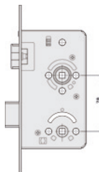
Fig.: WC type